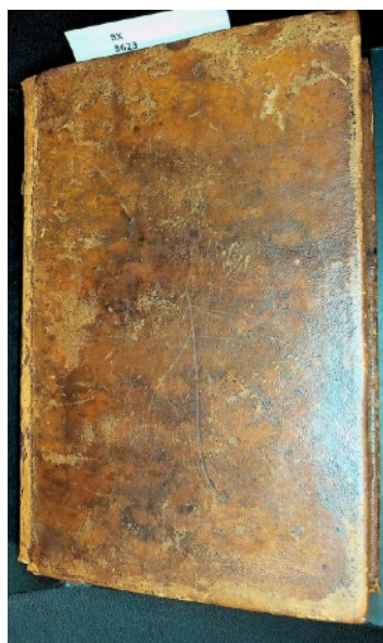
Book of Mormon Census